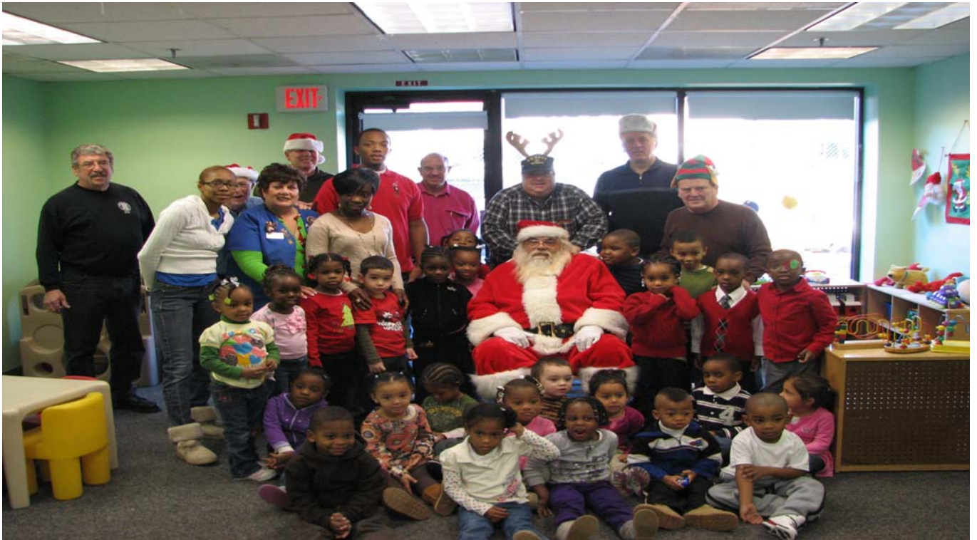
Chapter 333 members giving Holiday Joy to the Rainbow Connection Child Care Learning Center in Nanuet where the combined family income is $15,000.00 or less for these children.