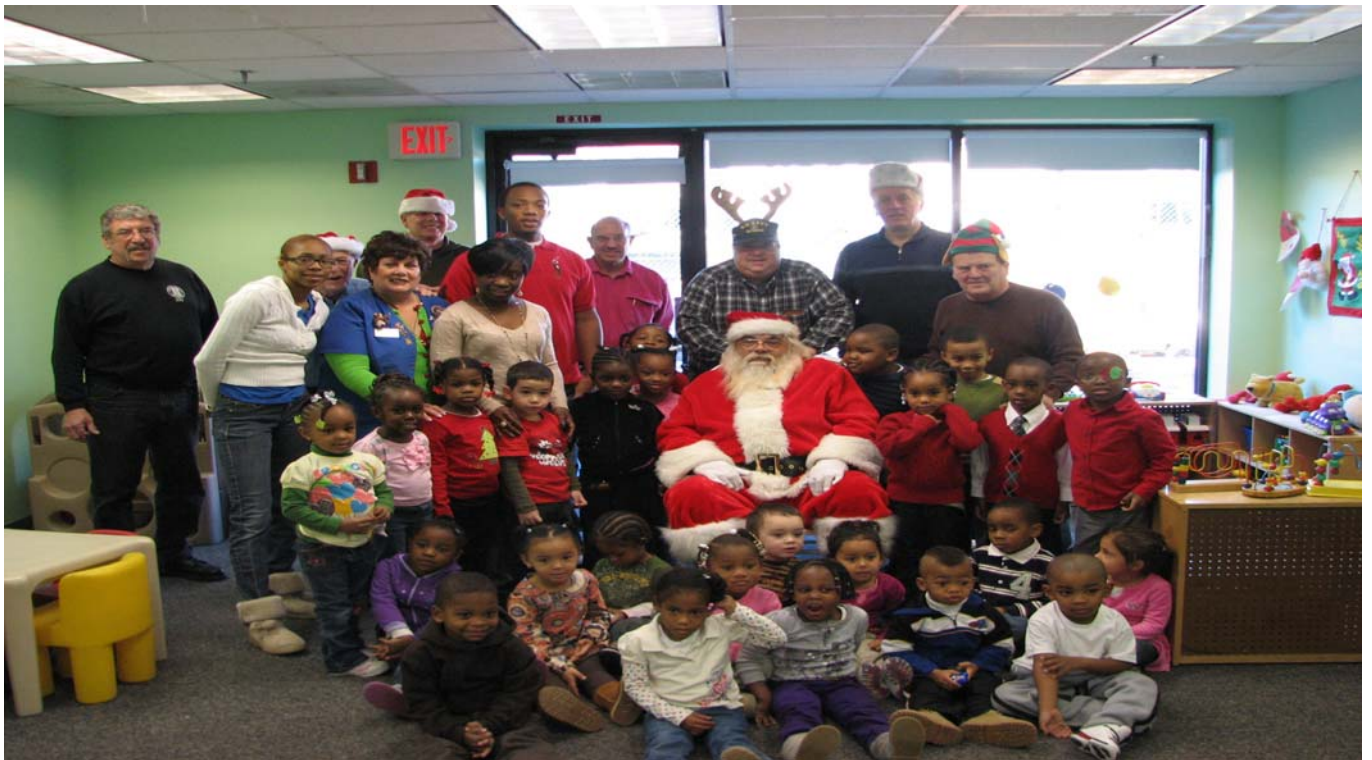
Chapter 333 members giving Holiday Joy to the Rainbow Connection Child Care Learning Center in Nanuet where the combined family income is $15,000.00 or less for these children.